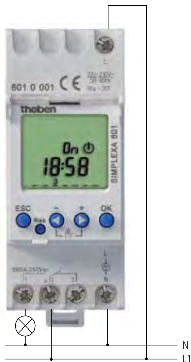
SIMPLEXA 601 – Connection diagram