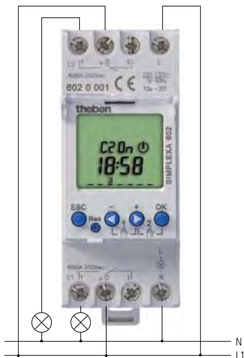
SIMPLEXA 602 – Connection diagram